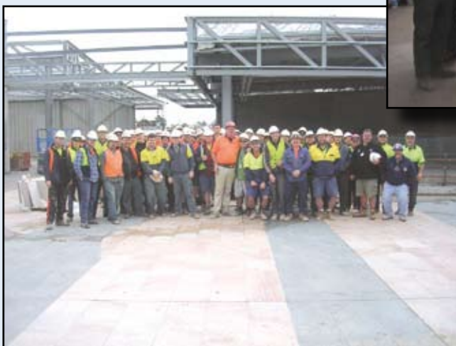
Plumbers' Union members working at Rouse Hill