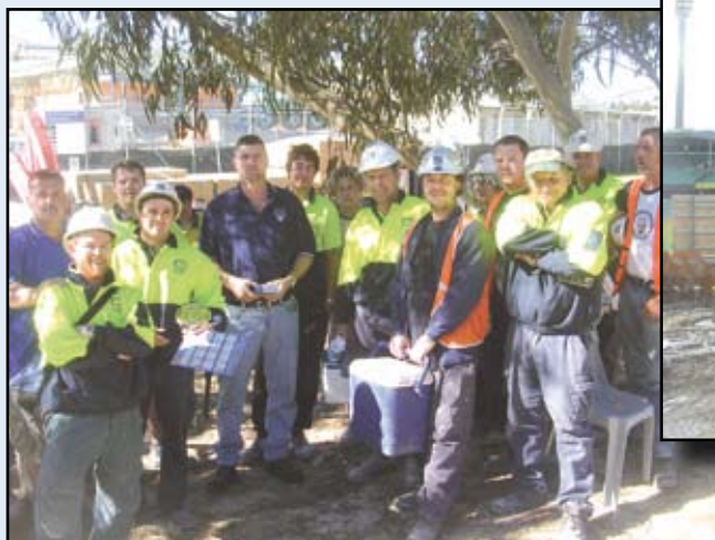
The boys from Long Bay Jail