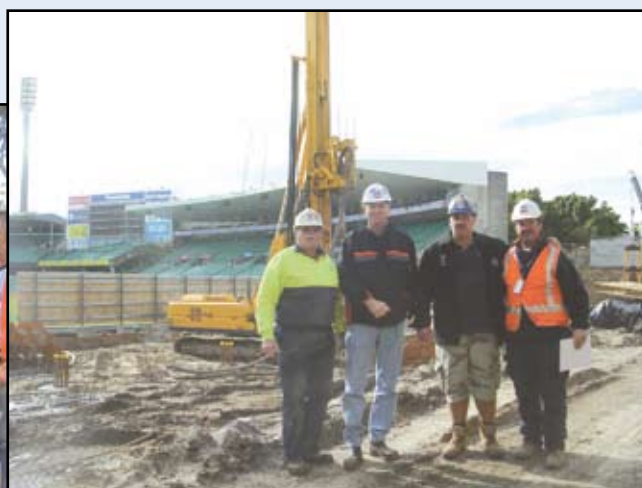
On site at the SCG